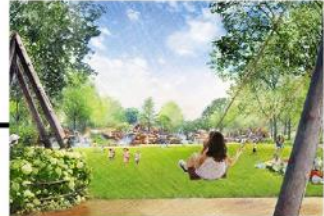
Gateway Plaza and Play