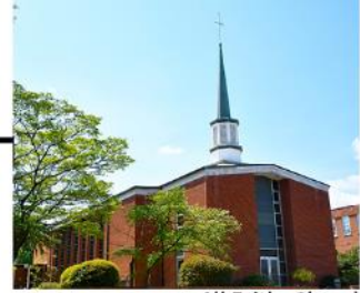
All Faiths Chapel