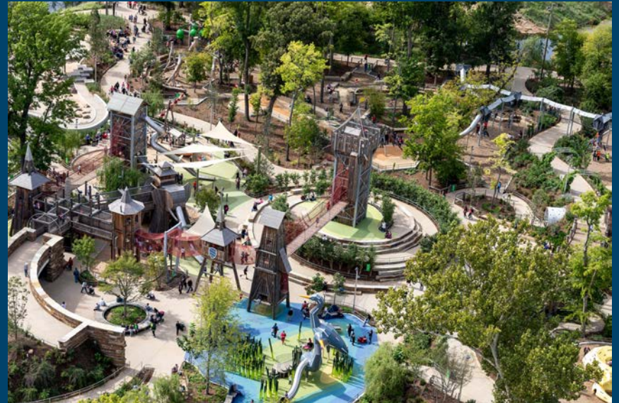
Gathering Place at Tulsa